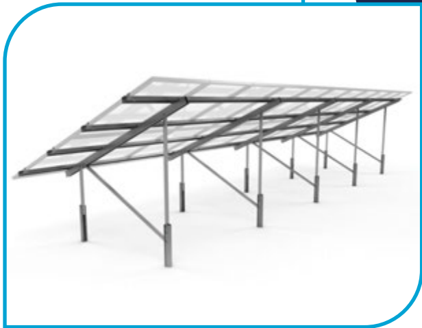
Fix Tilt Structure