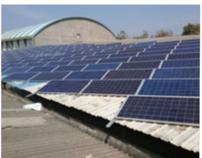
Solar Panel Structure Mounting on Tin Shed