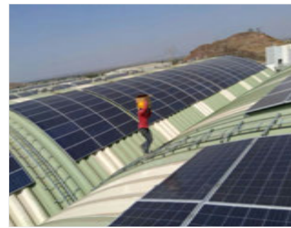
Mounting on Dom Shed