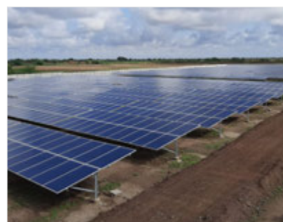
Solar Panel Structure Mounting on Ground