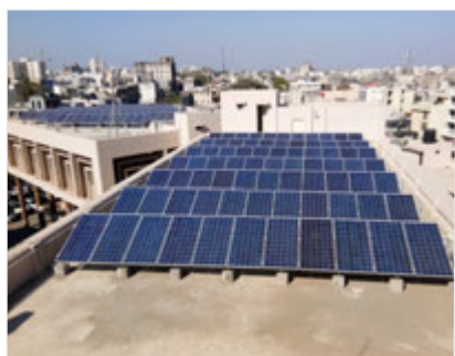
Solar Panel Structure Mounting on RCC