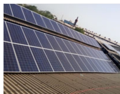
Mounting on Cement Roof